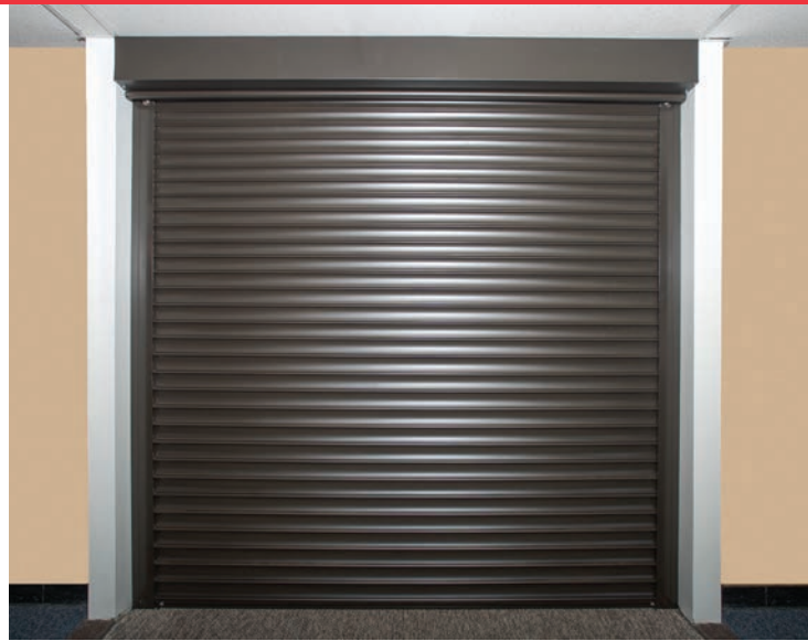
Standard slat, PowderGuard® Premium powder coat finish in Bronze

Allura® Model 653 is a next generation light-duty door solution that is versatile enough for specialty uses and has a space-saving design, making it perfect for installations with limited side room and headroom. Multiple perforation and fenestration options allow for many configurations with the right amount of light and air passage.