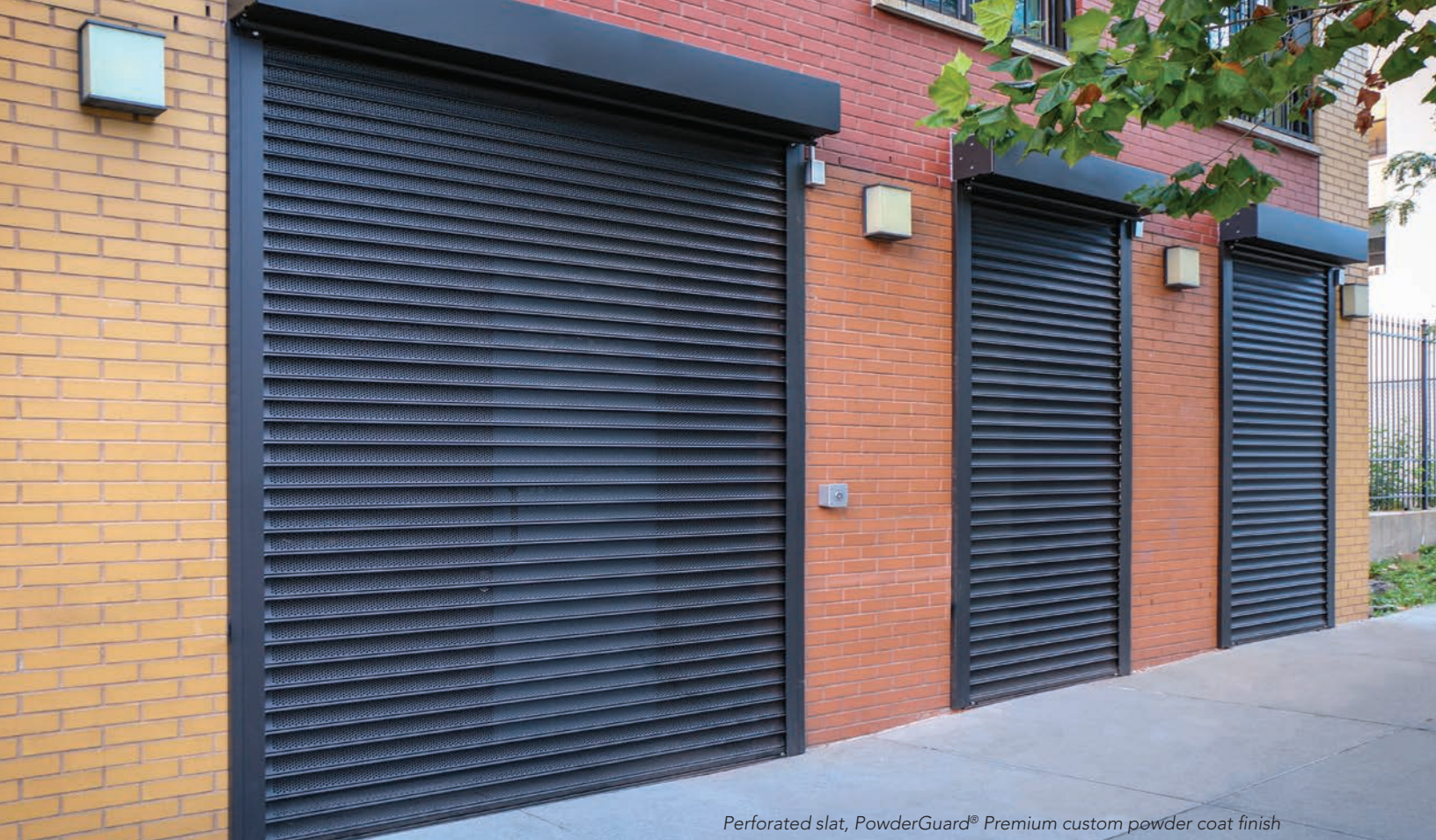
Perforated slat, PowderGuard® Premium custom powder coat finish